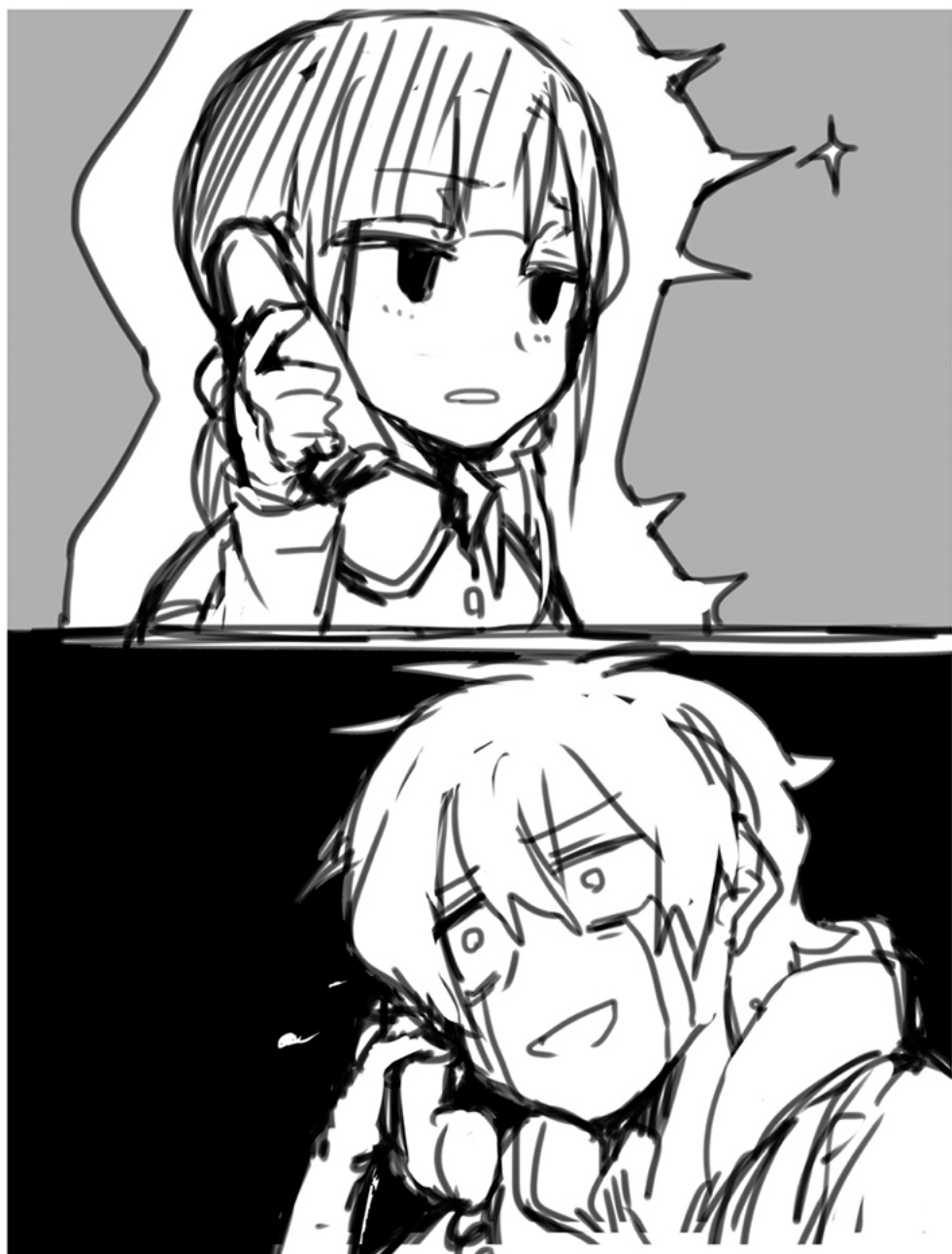
ILLUSTRATION 2 SKETCH