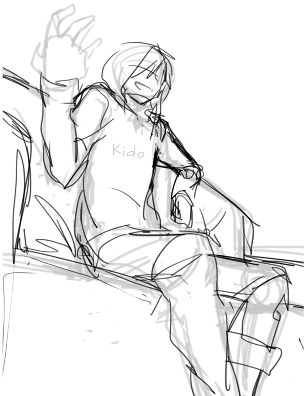
ILLUSTRATION 5 SKETCH