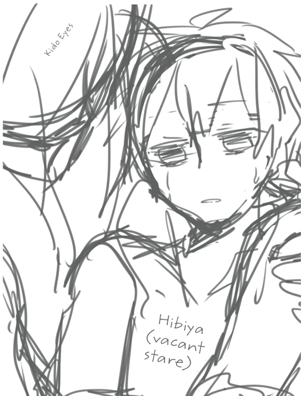
ILLUSTRATION 4 SKETCH