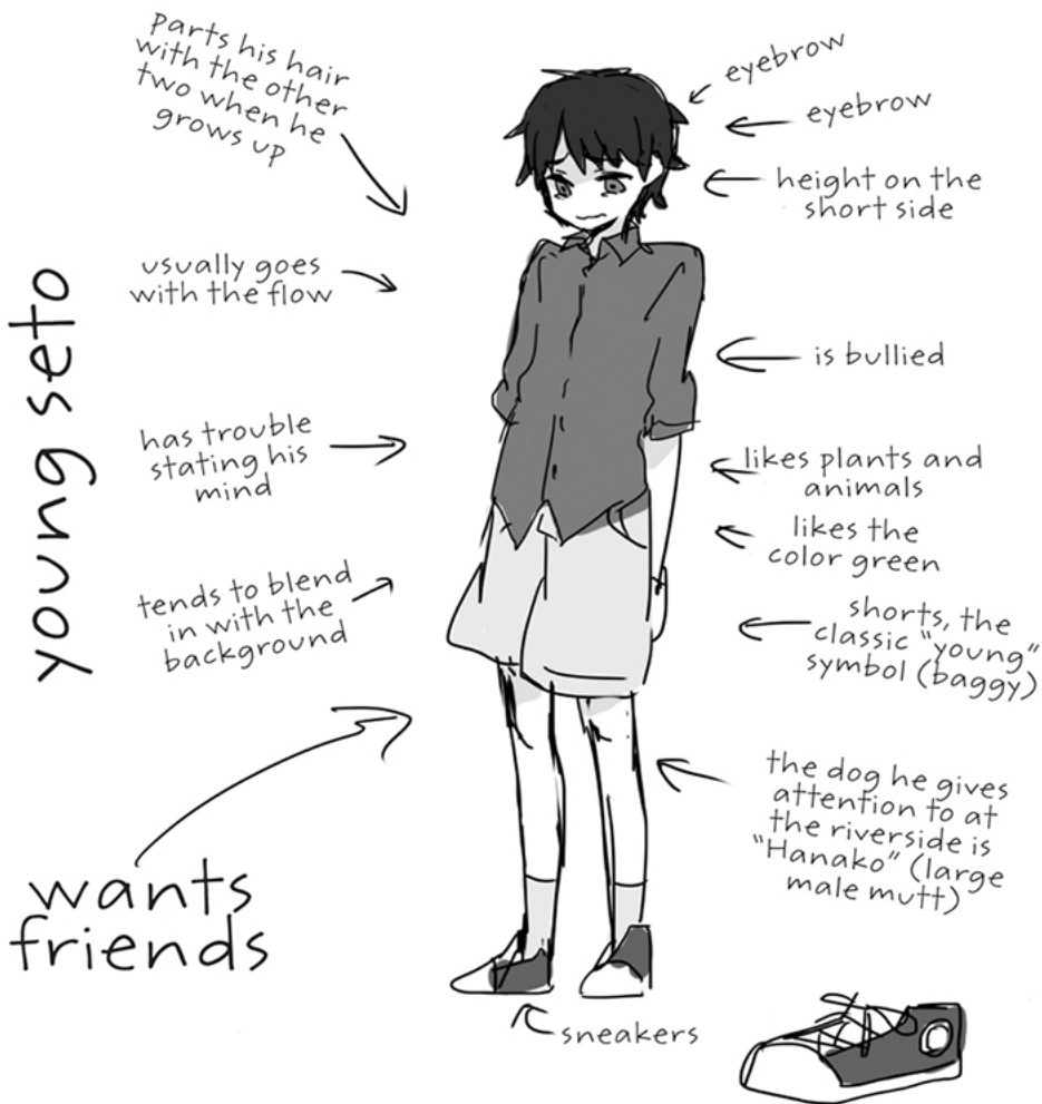
YOUNG SETO (FROM CHARACTER DESIGN SHEETS)