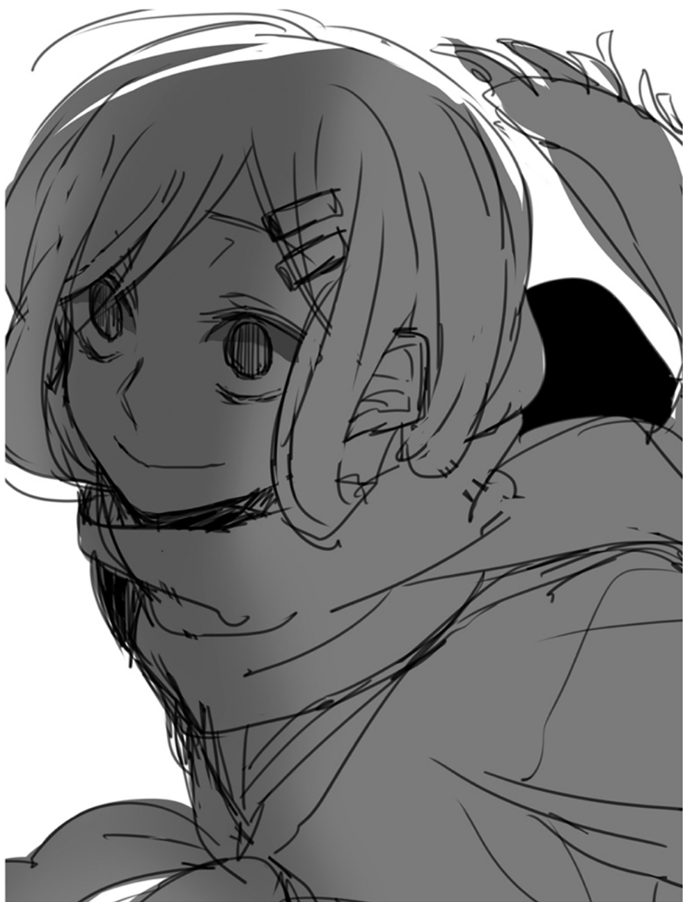
ILLUSTRATION 6 ROUGH