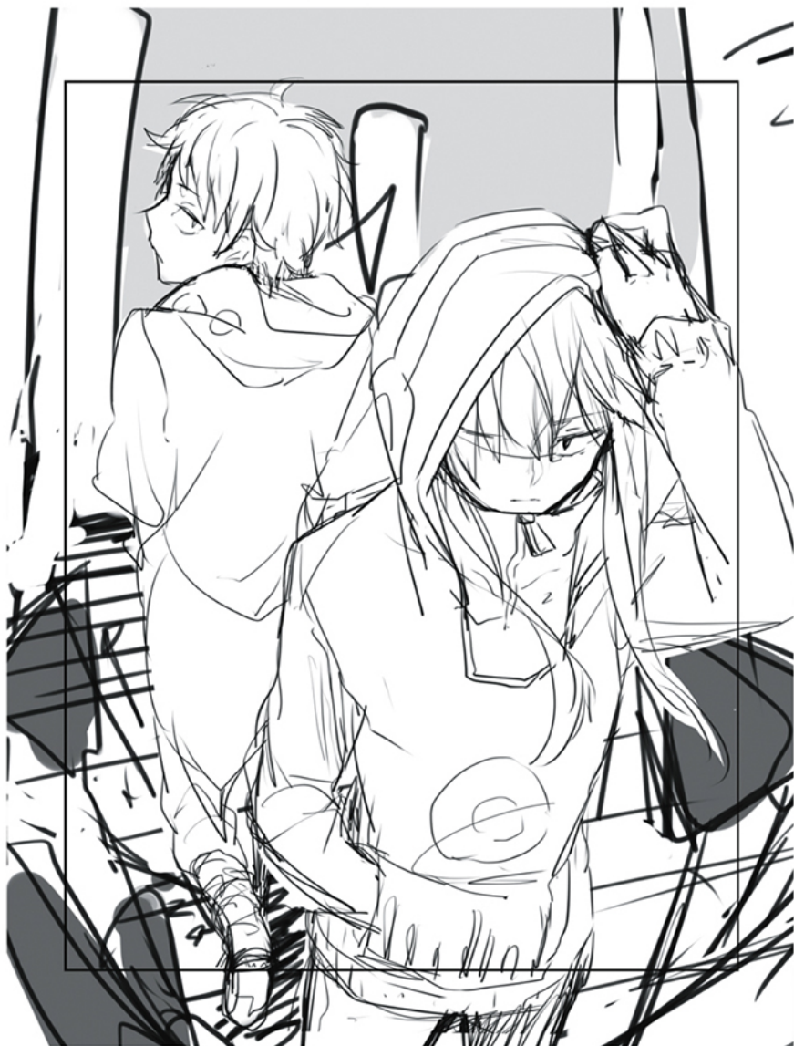
VOLUME 3 COVER SKETCH