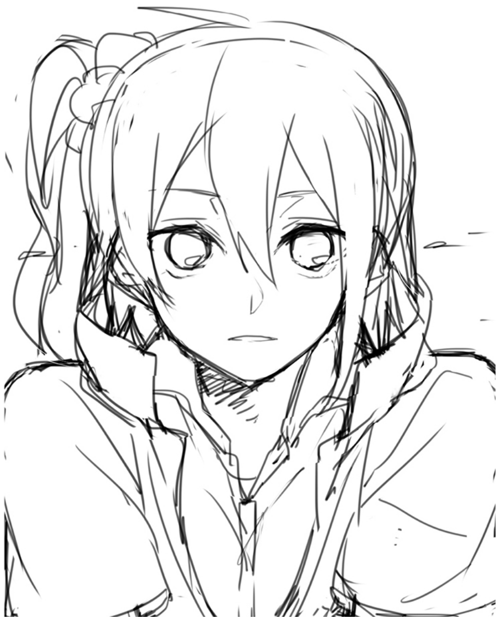
ILLUSTRATION 8 SKETCH