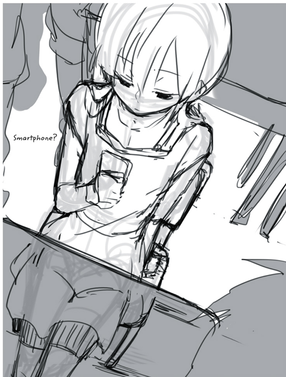
ILLUSTRATION 1 SKETCH