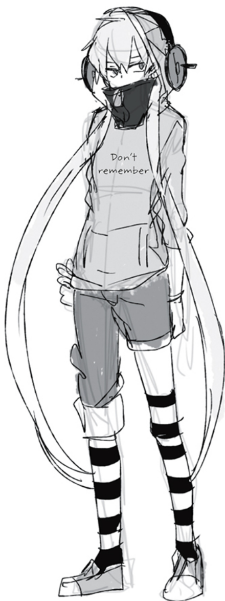
KONOHA INITIAL DESIGN CONCEPT (FROM CHARACTER DESIGN SHEETS)