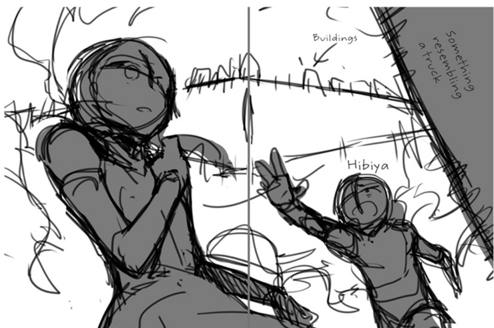
ILLUSTRATION 7 SKETCH